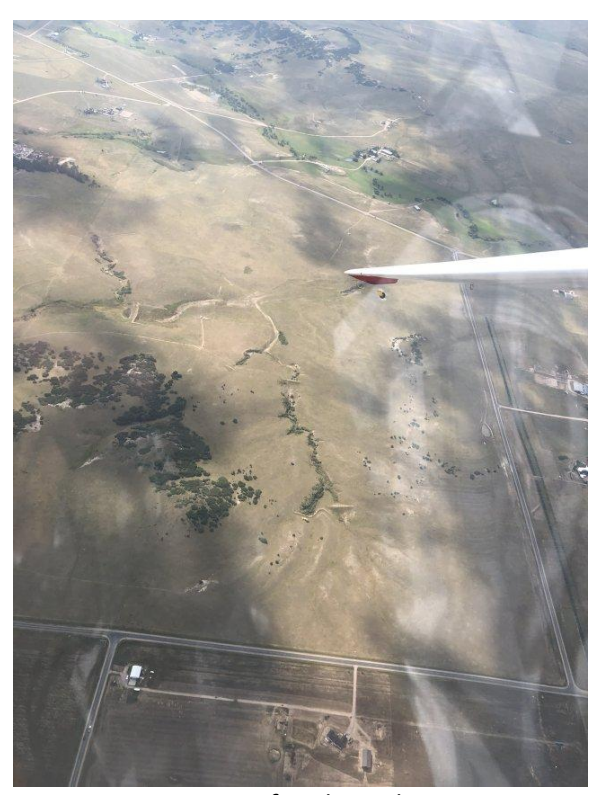
View of Ambrosich