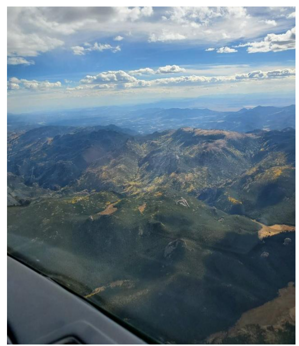
Clay Thomas took this picture of Bison Peak, 9/26/21.