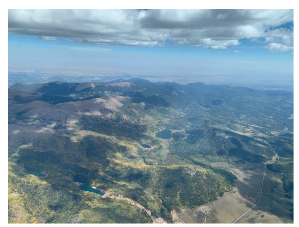
Jeff Maki took this photo of fall colors from the back side of Pikes Peak, 9/26/21.