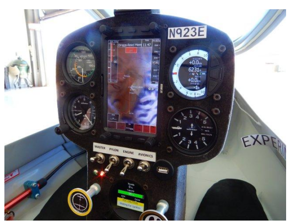
The Front Office