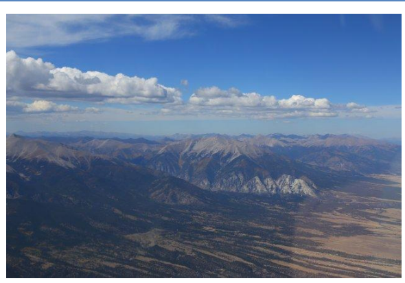
Clay Thomas took this beautiful fall picture on 9/26 near Salida, looking northwest into the Collegiates.