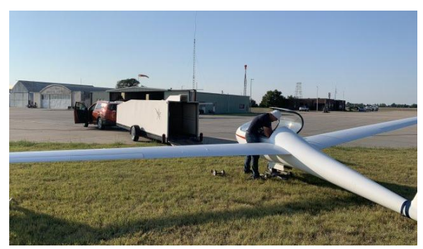
7E retrieve at Colby, KS. 9/4/21.