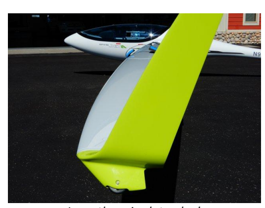
Love the winglet color!