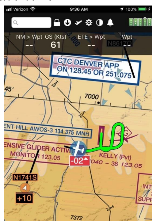
N1741S is a potential conflict.

to find the fish in the pond visually with your head on a swivel.