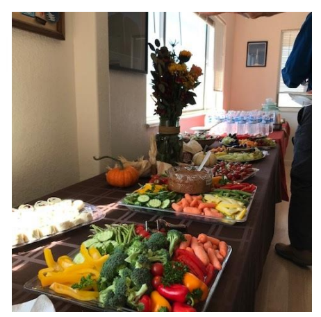
A wonderful lunch