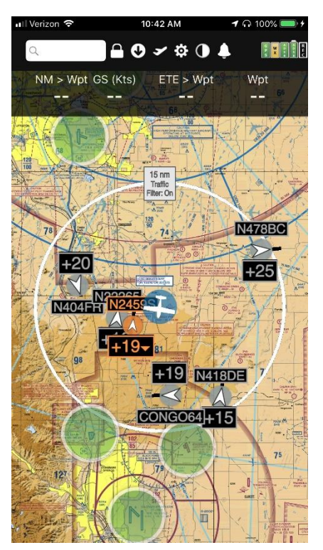
Looking above runway

Here are some screenshots from a recent Friday tow day. Clearly we are not alone! The first screenshot shows what is above while sitting on the runway staging for a tow. The white ring is a 15nm traffic filter showing traffic only within that ring. I have also disabled traffic notifications for anything above 3500ft.