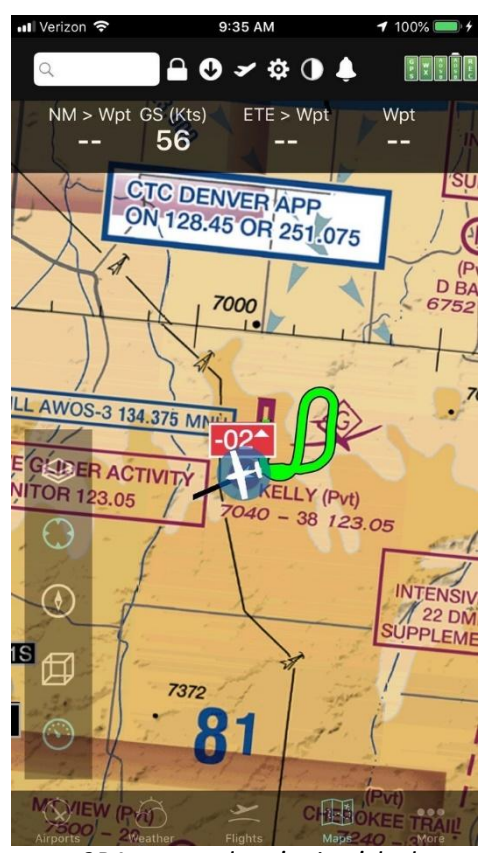
9BA at towplane's six o'clock

The second screenshot shows what it looks like during a tow when a non-ADS-B-out equipped plane turns their mode C transponder to ALT. In this case it was 9BA. Right on my six, 200ft lower, climbing, and the bug has turned red indicating an imminent potential conflict.