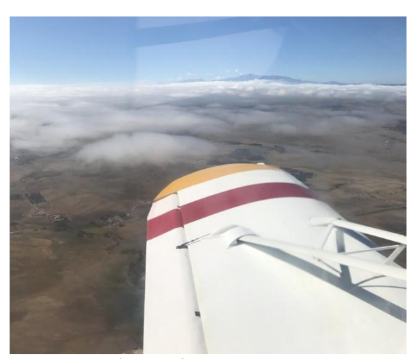
Clay's view from the towplane