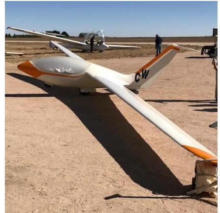
Charlie Whisky