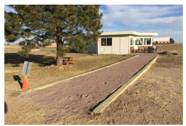
Almost done! Rails and detail work to come.