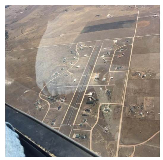
KAP on an autumn day