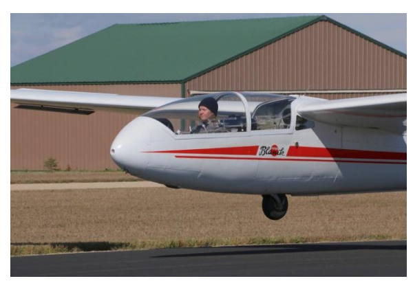
Julie Kinder's first solo landing! Sweeeeet!