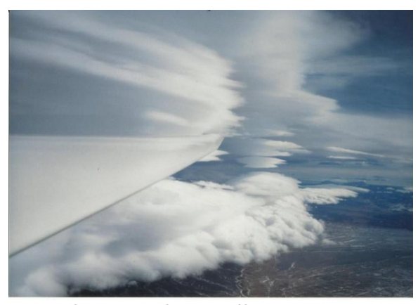
Wave flight out of Westcliffe, Colorado.