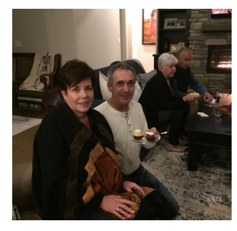
The happy couple celebrates with friends