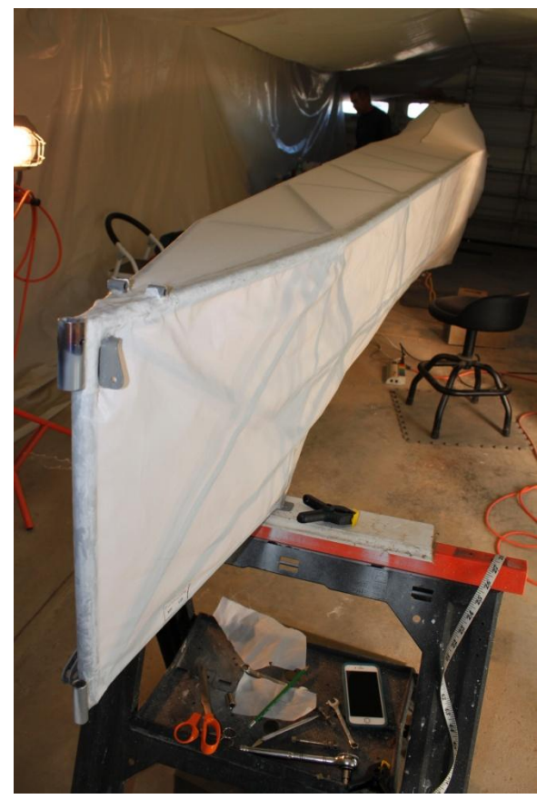
Bottom and left side fabric is glued (fuselage is upside down)

In October we completed gluing the bottom and left side fuselage fabric. It's starting to look like an aircraft again! Thanks to Doug Curry for his patience as we continue with the detail work that takes a lot of time.