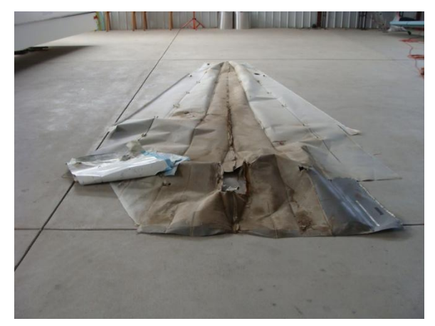
840 sheds its skin

Disassembly, welding, and some initial work took place at Doug's hangar—thank you for the space and use of your tools Doug!