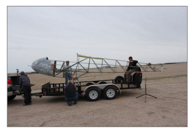
Getting ready for a short-distance transport

After some initial cleanup and sanding, we moved the fuselage into the BFSS third hangar shop area. Thanks, Gary, for the use of your trailer!