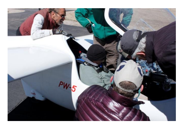
It takes a Village