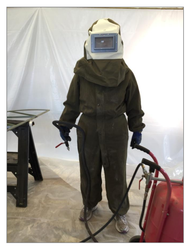
The Aliens came to help