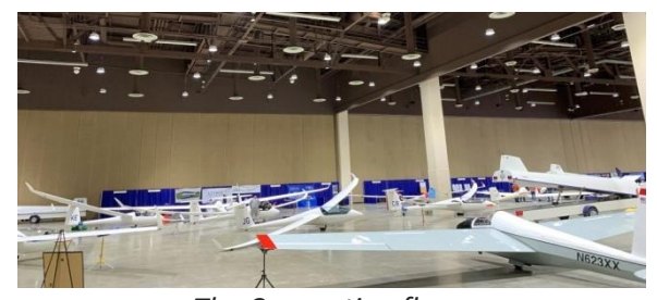
The Convention floor