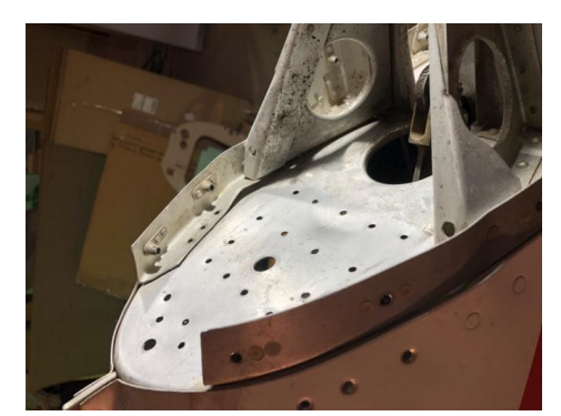
L23 fin spar damage.

Doug Curry has been working diligently on repairing the landing damage to the L-23. While the main gear repair is essentially done, Doug later found damage to the fin spar assembly. Obtaining parts has slowed down the process, but things are now proceeding at a faster pace. Below are a couple of pictures of the damage and repair work. A gentle reminder NOT to land tail first in the L-23!