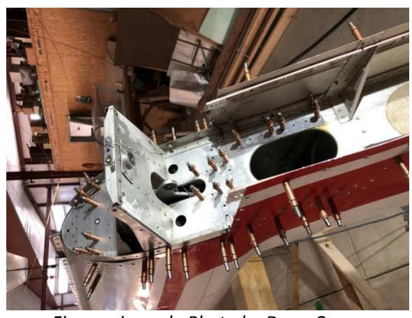
Fin repair work.