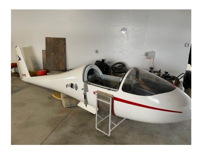
FOR SALE: 1/3 share in ASW-26E motorglider D2D. Based at CO15. If interested, contact Gerald Peaslee .

FOR SALE: AC-4C Russia, S/N 26. Fuselage was damaged in off-field landing. Wings and tail are fine, trailer is good. Should make a great project glider. $4000. Contact John Gillis.