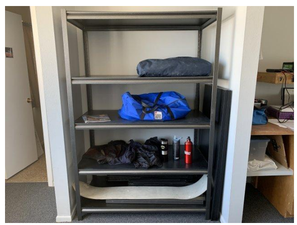
The new parachute rack, courtesy of Bif and Alan Hoover

Bif donated a rack system. Becky, with Alan Hoover's help assembling the rack, installed it in the battery room. Now the parachutes for 1GM and Z3 have a nice place to rest.