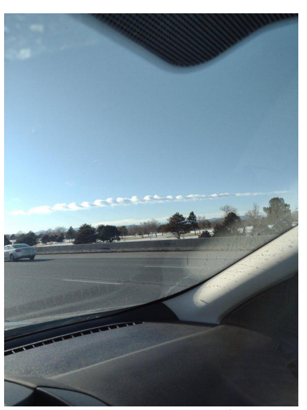
Brian Price caught this picture of some Kelvin-Helmholtz clouds, 2/8/2022