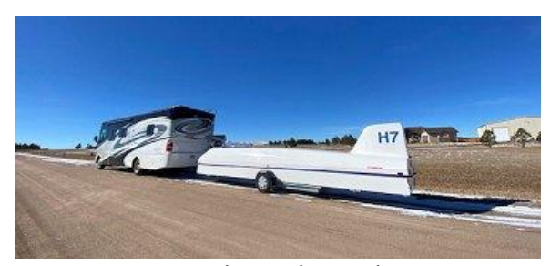
Hotel 7 on the road