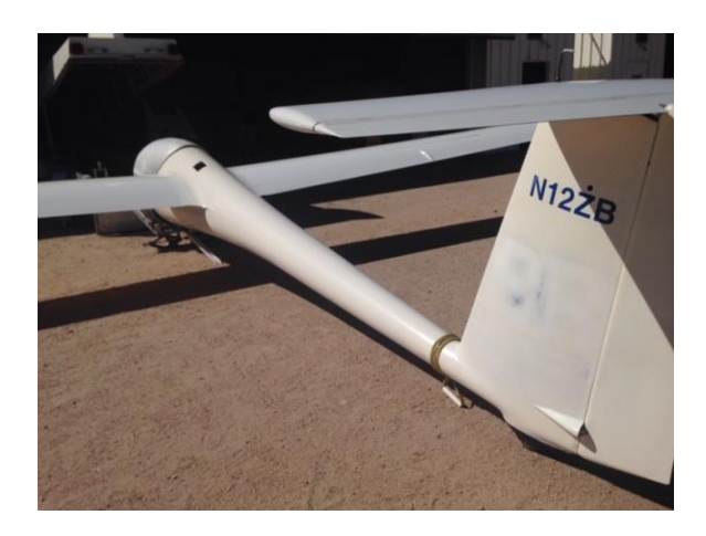
FOR SALE: 1/3 share in ASW-26E motorglider D2D. Based at KAP. If interested, contact Gerald Peaslee .

FOR SALE: ASW-20A, has winglets and lift-up instrument panel. Top of wings have been refinished. Current condition inspection. Oneman rigger, wing stands, tail dolly, and wing wheel. $25,000. Contact <u>Jeff Sherrard</u>.