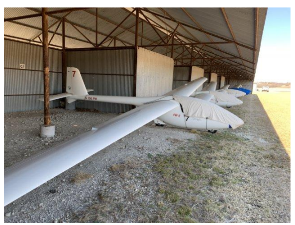
A lineup of Texas Soaring Association club gliders at Midlothian, TX—three PW-5s and two 1-26s