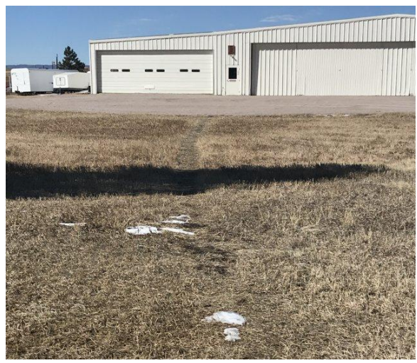
The Buildings and Grounds manager asks you to walk to the left or the right of the current path to the 3<sup>rd</sup> Hangar. As you can see, the path is creating quite a rut.