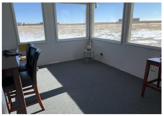
The new "atrium"

Buildings and Grounds leader, Becky Kinder , continues to make great headway in remodeling the clubhouse. This month, new carpeting was installed. And what a difference! Thanks Becky and company! Now, everyone please wipe their feet before entering! And remember to vacuum at the end of the day.