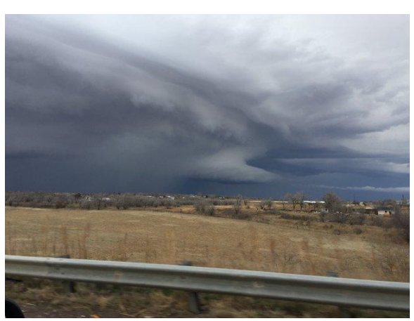
Thunderstorm near McLean, TX, February 23, 2020