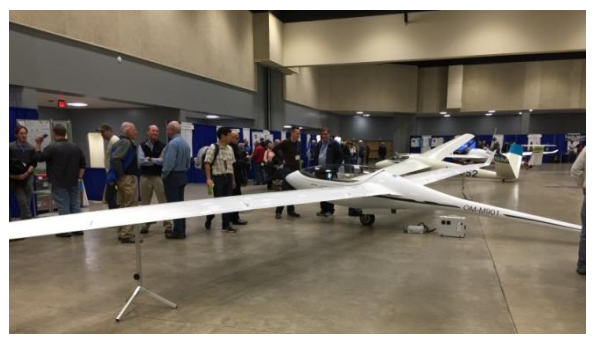
Raul Boener should have one of these by summer.