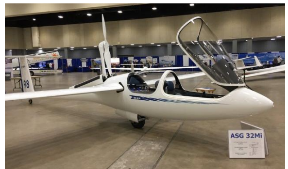
Dave Rolley had to be restrained from buying one of these.

As has become the usual standard the last few conventions, the show floor was dominated by motorgliders. In fact, the only pure sailplanes on the floor were an SH-1 Austria and a 1-26D. Our Pres, Bif Huss , displayed his Ventus 3M. (Given the number of people pushing and prodding and jumping in and out of H7, I'm sure Bif was a bit nervous.)