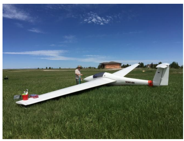
Some people water grass, but Brian Price is watering his 1-36.