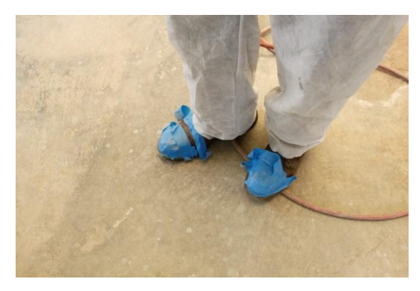
'Well, you can do anything but stay off of my blue tape shoes'

I should also note that some of our team members have been playing hurt, and they still show up every week. Among us we've had two bad backs, a sore knee, and a cranky shoulder, but you can't tell from all the hard work. Thanks team!