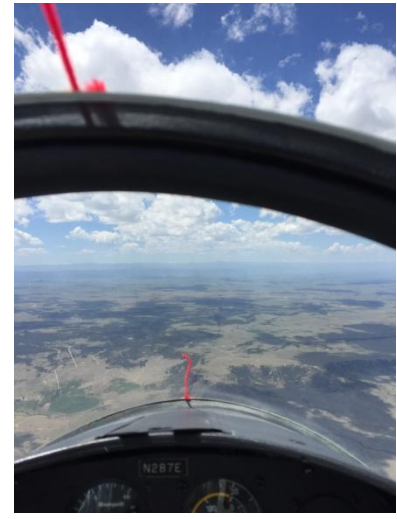
Looking northwest from Calhan in the Russia

We're starting to rack up miles on the Online Contest (OLC)!