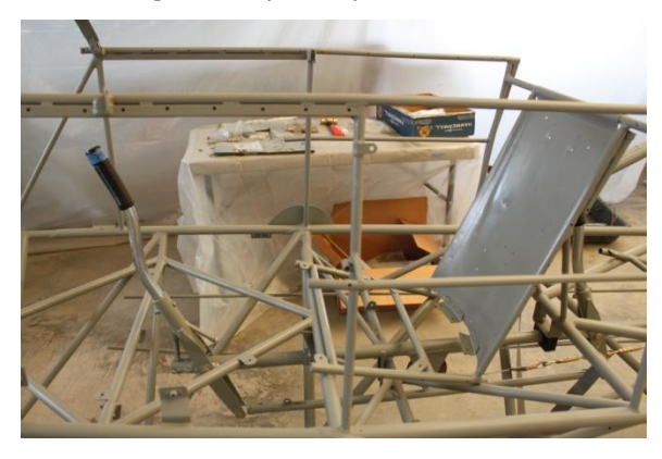
Elevator controls going back in

After the critical assemblies are reinstalled, we'll be ready for the really fun part. The hard work will pay off as we begin to install the new fabric using the PolyFiber process.