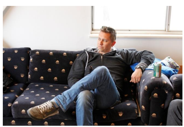
'If I get the Russia out now, can I get in 200K and be home in time for dinner?'