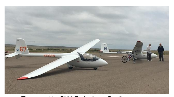
Two pretty PW-5s in Low Performance