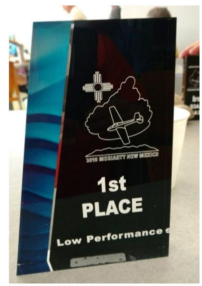
First place!