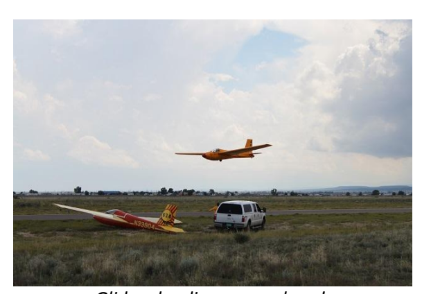
Gliders landing everywhere!