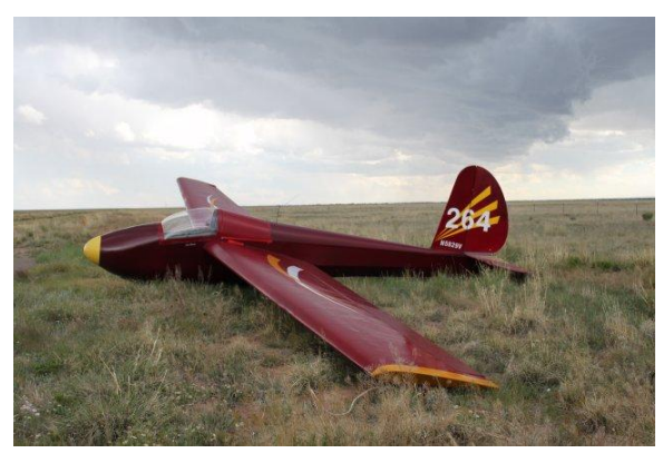
Waiting out the storm