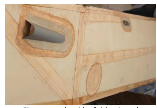
Elevator and rudder fairleads and inspection ring with gussets installed.

The team continues to make progress laying finishing tapes. After we take a break for some vacation time, we'll be ready for a final push to finish this work so Doug can begin spray coats.