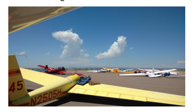
Waiting to launch

Some lessons learned for other lessexperienced pilots: (1) keep a big bolt cutter and a fresh padlock in your tow vehicle; (2) be 100% ready early each day, with electronics, personal gear, trailer, and all equipment in place and understood; (3) practice altering the task, turnpoint dimensions, and other task elements on the fly; (4) the human body has to be protected from sunburn, dehydration, and exhaustion; and (5) it's a load of fun! Next year's 1-26 and Low Performance Championships will be held at Sunflower Gliderport in Yoder, Kansas, near Hutchison. We are hoping that BFSS will send the Russia and the PW-5 to mix it up with the others in our handicapped class. Now is the time to start training for competition tasks, so who is game for the challenge?