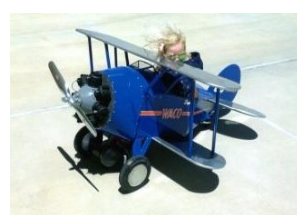
Sophie's Straightwing pedal plane

They much appreciate BFSS members' help and support. When the Allens are not out on their frequent biplane trips, they heartily welcome everyone interested to stop by their hangar for a look at restorations of a long past era of aviation.