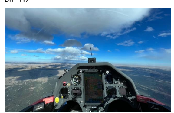
Bif running the Palmer Divide convergence line, 12-6-22