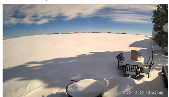
Yes, I think ops are canceled for today.