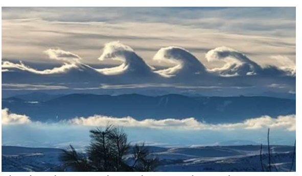
This has been making the rounds on the Internet lately: Kelvin-Helmholtz clouds in the Big Horn Mountains. 12/6/22. K-H clouds indicate severe turbulence