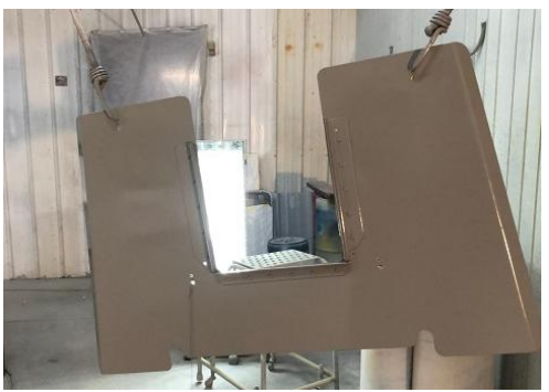
Doug's painted panel

Doug fabricated a new front floor panel to replace the old bent, cracked one. It's a thing of beauty. I took it home to etch and alodine on a cold and windy day, then Doug found a warm hangar at Meadowlake Airport to paint it.