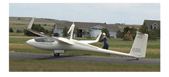
FOR SALE : Lak 17 AT SN 163, 1070 hours, sustainer motor, excellent condition $69,000. Contact <u>Clay Thomas</u>.

Have a ship you want to sell? Looking for a partnership? We can list it in Airworthy . FOR SALE: 1/3 share in ASW-26E motorglider D2D. Based at KAP. If interested, contact Gerald Peaslee .