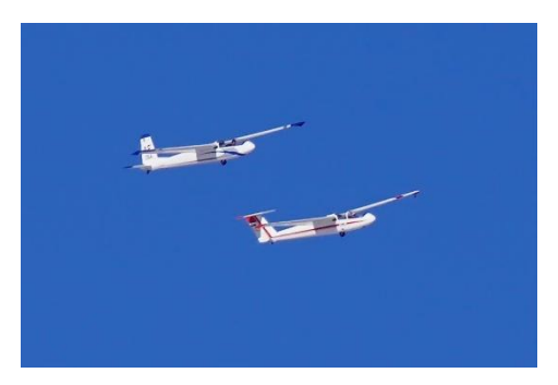
1/28/24. 2BA (top) is flown by Rutger Olsen. Stan Bissell is flying 9BA (below) on Rutger's wing.

So many thanks on this: Doug Curry , Bill Gerblick , Stan Bissell , and all the club members who have helped assemble and disassemble it.