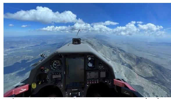
Bif Huss southbound over the Sangres, 8/11/22

• Description: It's all for fun but if it isn't on the OLC, it didn't happen.