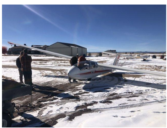
Stan Bissell, center, prepares to take 9BA on a test flight, 1/28/24.