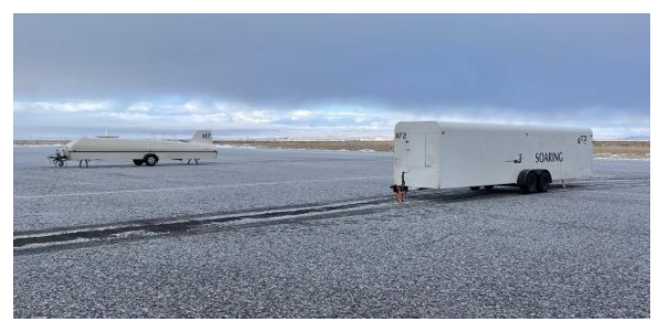
There's a long story here about how Hotel 7 and 77 ended up parked on the ramp in Pinedale, WY.