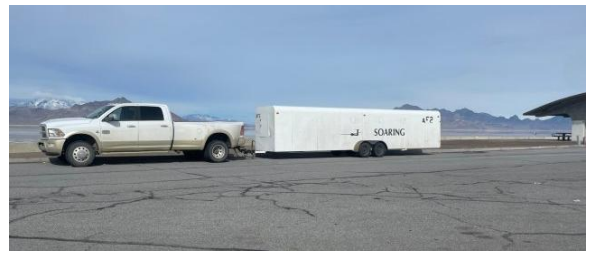
Bonneville Salt Flats, UT