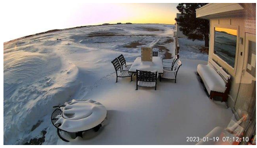
Time to put the skis on the Pawnee.