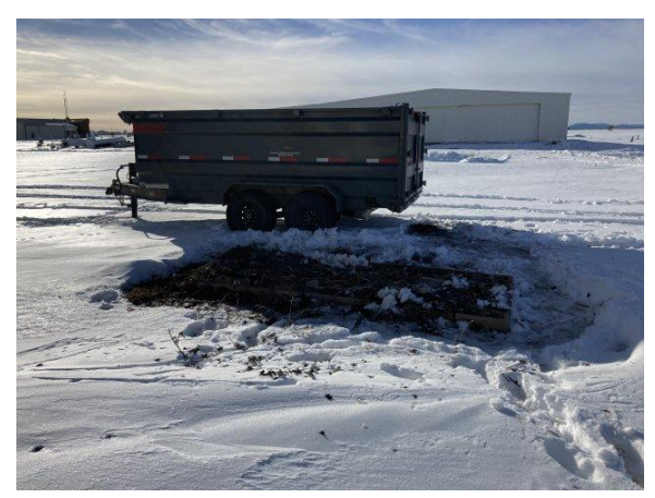
Final results of the fire pit cleanup project!

Doug Curry and Bill Gerblick – For continued work on hangar doors