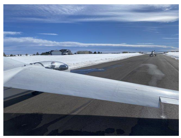
Icy Launch