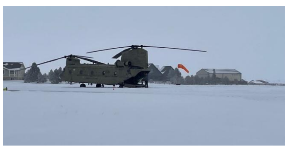
Saturday, January 21, was a no-fly day for us, but an Army Chinook crew took refuge at Kelly when the weather to the south went IMC.

The winter snow season is here. Please, DO NOT drive the golf carts on the grass. Driving on the grass could result in deep ruts and a lot of headaches for the club and airpark users. Also, please be careful of the runway shoulders while the new grass is taking hold.