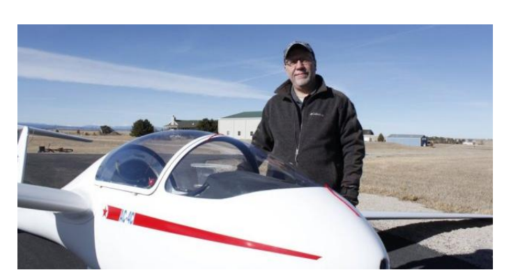
Kip Flies the Russia