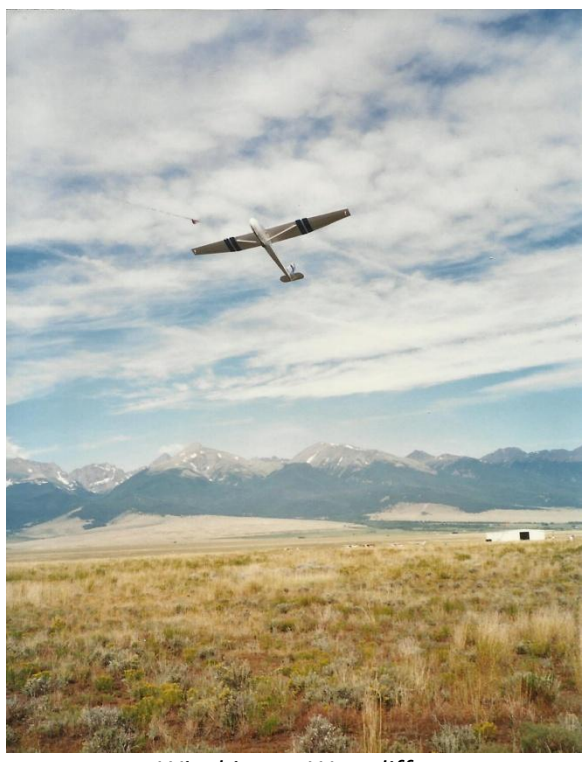
Winching at Westcliffe

from many participants confirmed that the event was a great success.