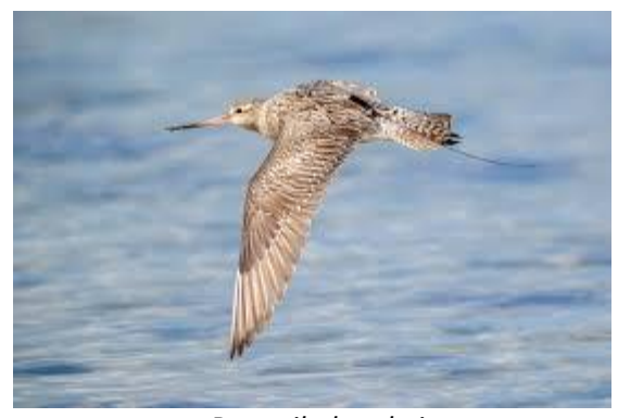
Bar-tailed godwit

By the way, I highly recommend The Thermal podcasts.