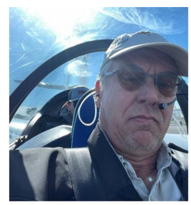
Concentration in a busy cockpit

So then we relight, simulating a relight to avoid a landout. Power on, mast up, prop stop off, ignite, monitor the engine. Climb if it's producing power, land out if it's not, and basically coming in with half spoilers. We climb back up to 2000 AGL and shut down. Land as a normal glider. Now it's my turn.