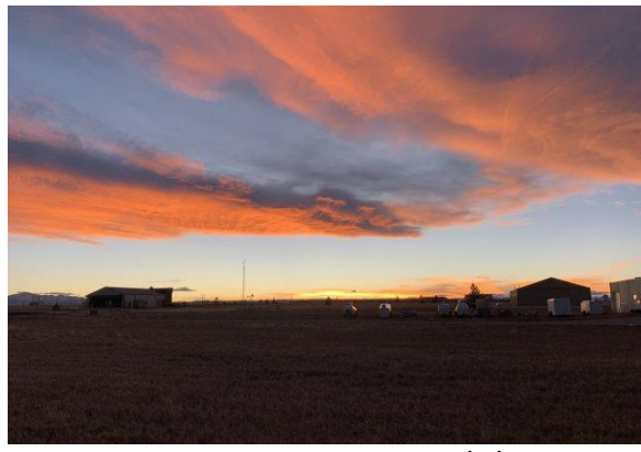
Autumn wave at sunset 11/7/22