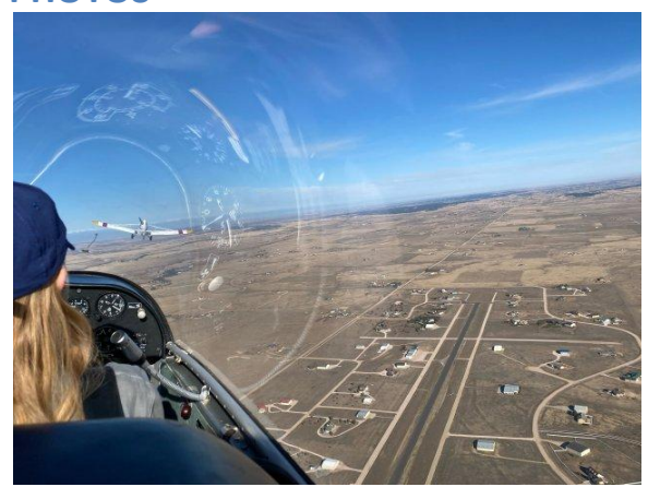
Stan Bissell took this picture of Berea Boerrigter on tow. 10/30/22