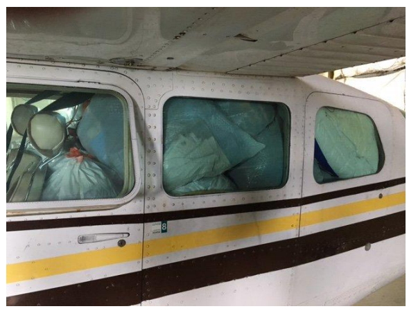
460 pounds of donated clothing!

Winter is here. Please, DO NOT drive the golf carts on the grass. Driving on the grass can result in deep ruts and a lot of headaches for the club and Airpark users. Also, please be careful and avoid driving on the runway shoulders while the new grass is taking hold.