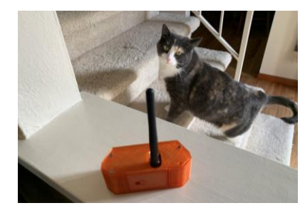
OGN transmitter. Cat not included.

Dave Rolley – For work on adjusting the ASK-21 airbrakes and for setting up and building a case for Crew 182's new OGN transmitter