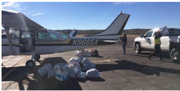
Unloading on the ramp at Gallup, NM