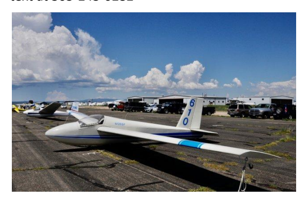
610 and its panel

Tom Mottinger – <a href="mailto:timeger@msn.com">tmmottinger@msn.com</a> or text at 303-243-0282