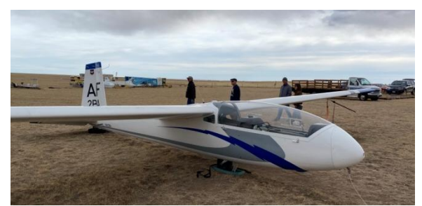
2BA rejoins the fleet.