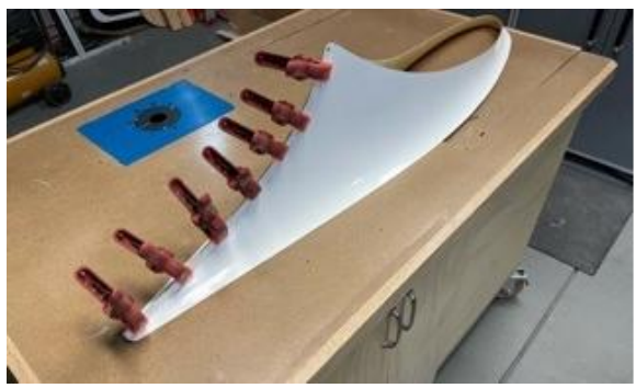
Besides building a new Russia tail dolly, Bill Patrick also worked on the trailing edge of the wing fillets.