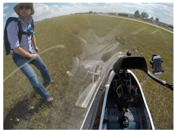
Joshua Abbe checks for landing traffic after landing the PW-5 on the grass. 9/4/21