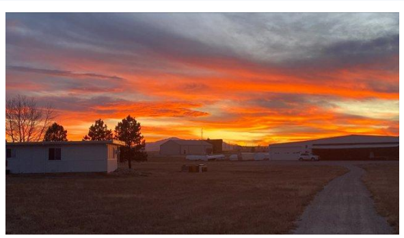
Doug Houston took this beautiful photo looking west. 11/28/2021