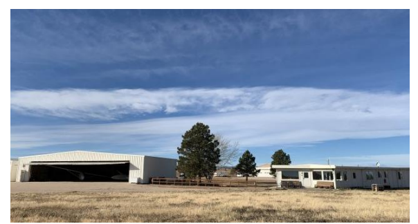
A Sunday morning