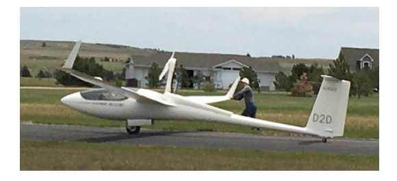
WANTED: Cobra or similar trailer for 15m standard class ship. Contact <u>Mark Palmer</u>

FOR SALE: 1/3 share in ASW-26E motorglider D2D. Based at KAP. If interested, contact Gerald Peaslee.