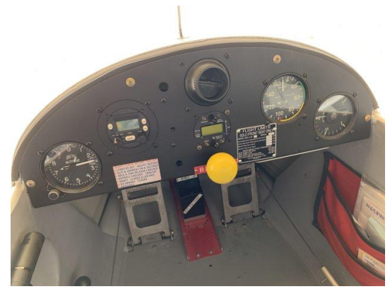
840 now has a transponder!