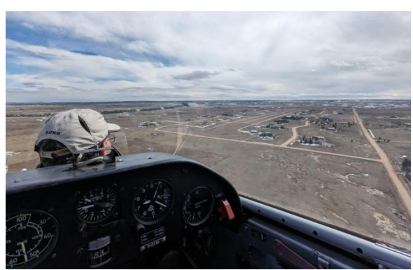
Stan Bissell prepares to turn final in 9BA.