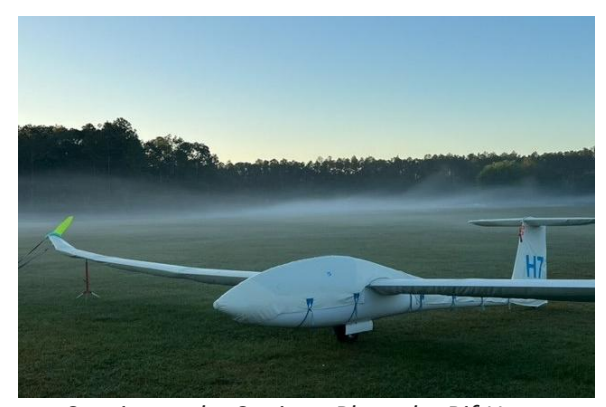
Sunrise at the Seniors.