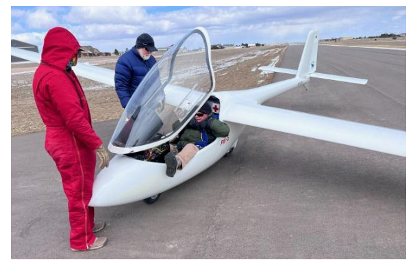
No Cockpit for Old Men The Editor struggles to get out of the PW-5 cockpit on a cold spring day.