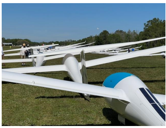
Another view of the Seniors grid